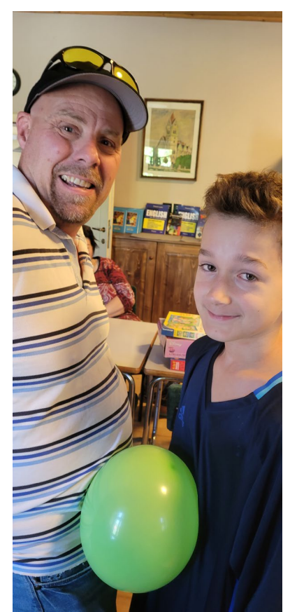
Therapeutic games like balloon walk