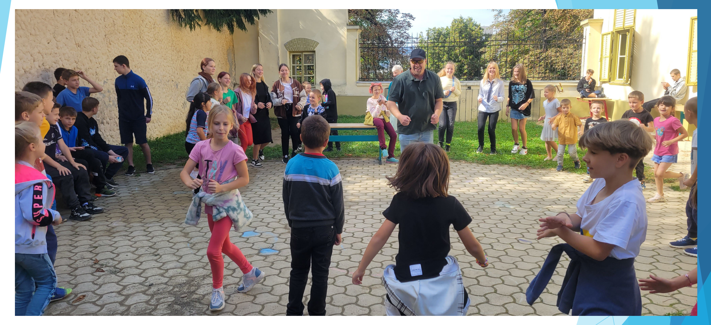
Traumatized Children, Building Trust©. Work with Ukrainian Orphans at School in Medias, Romania